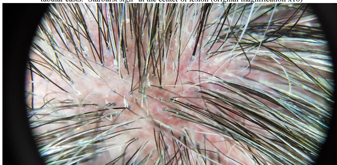
Fig.1. Patient, Nr 1. Non-polarized contact dermoscopy: Large non-focus vessels giving a red-hue appearance. Peripilar, tubular casts. ‘Starburst sign’ at the center of lesion (original magnification x10)

AZA: Azathioprine, D: Day, F: Feminine, mo: months, Nr: Number, PRD: Oral Prednisone, RTX: Rituximab, Tx:Treatment, Yrs: Years. +: Plus