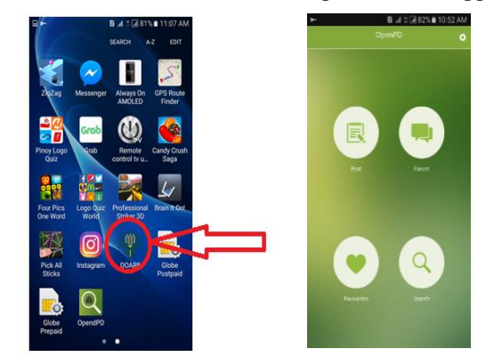
Figure 1(a-b). The EXE file of the developed Android Application

figure 1(a) below is the executable APK file of the developed system. Note, that the image used corresponds to the Department of Agriculture Logo so as to indicate the system general used.