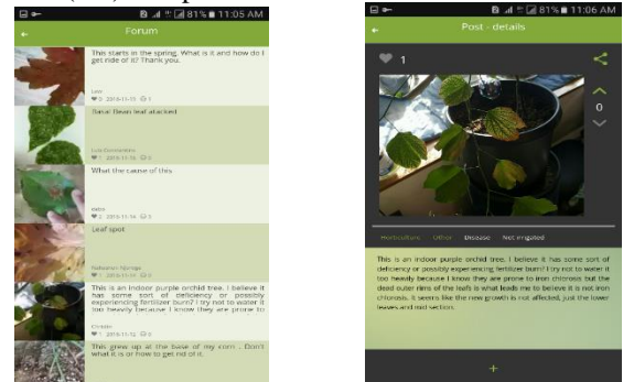
Figure 3 (a-b) Sample FORUM and POST transaction details

Figure 2-a, indicates that a user need to take a picture of a particular plant pest/disease he/she wants to POST or uploaded to the central server for data processing so as necessary data and information can be provided to him. However, in order for the system to generate a more specific data and information about the uploaded pest/diseases a user may opt to check a particular category of crops where the said pest/disease occurs as shown in figure 2-b.